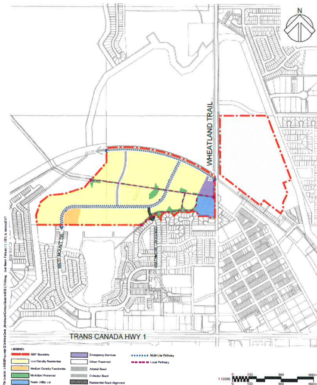
Map 7 Future Land Use Concept