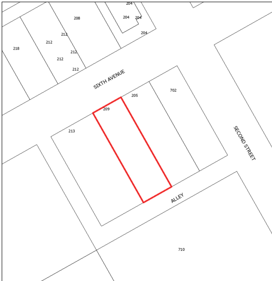
Figure 1: Direct Control District Overlay – 209 Sixth Avenue – Secondary Suite